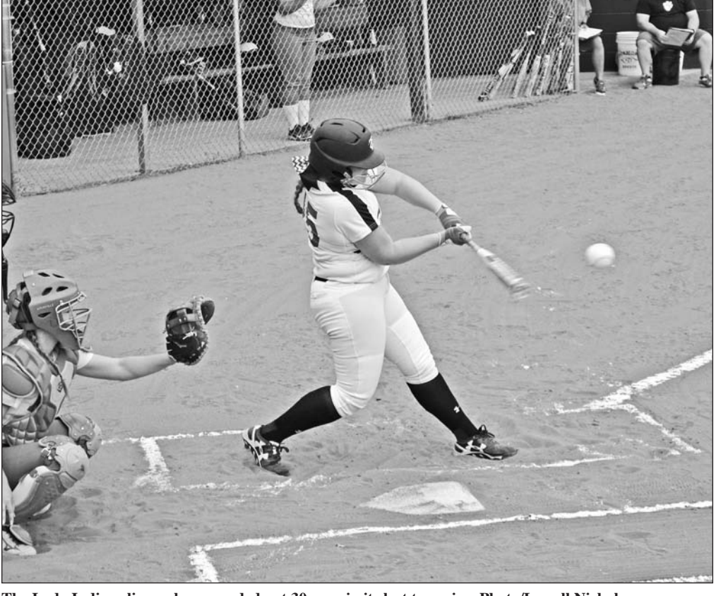
The Lady Indians lineup has pounded out 30 runs in its last two wins.

White County, Aug. 14, rescheduled for Sept. 27 doubleheader; Providence, Aug. 16, 17-2 win; Commerce, Aug. 17, 6-4 loss in extra innings; Fannin, Aug. 19, 7-5 loss; Hebron, Aug. 22, 13-0 win; Banks, Aug. 23, 8-0 loss;